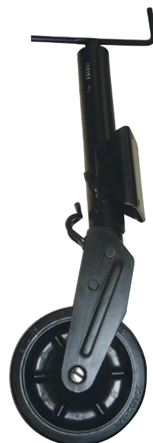
Part No. 622800