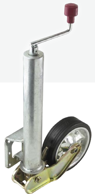
Part No. 622400

VIC: 67 Nathan Road, Dandenong South, 3175 Phone (03) 9767 3700 Fax (03) 9792 0877 NSW: 14 Toohey Road, Wetherill Park, 2164 Phone (02) 8784 9400 Fax (02) 9725 4557 QLD: 62 Parramatta Road, Underwood, 4119 Phone (07) 3386 6300 Fax (07) 3808 1719